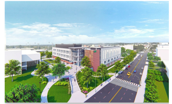
UAB Current Renovations